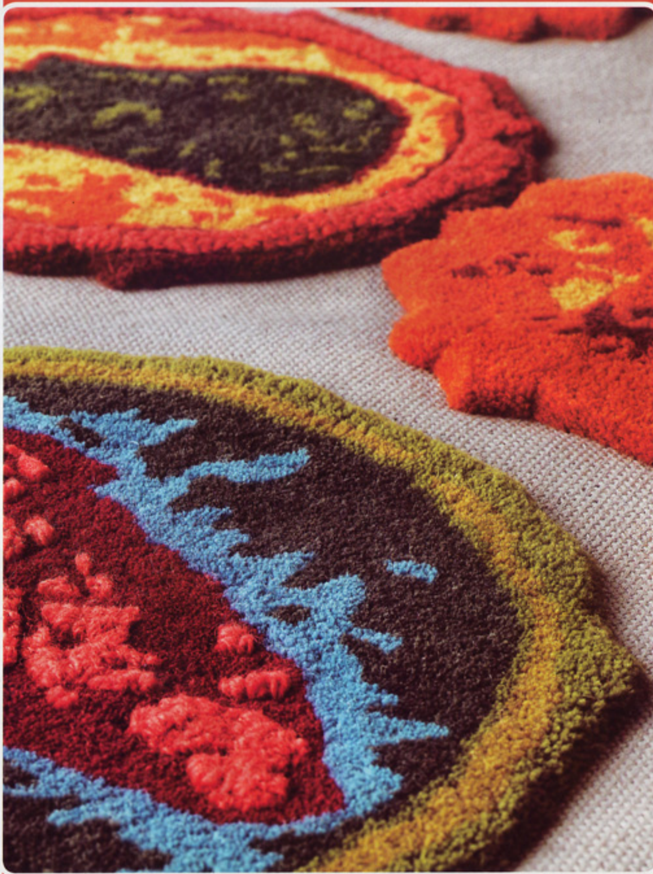
HIV wool-on-cotton canvas rug by Bev Hisey , circle 500